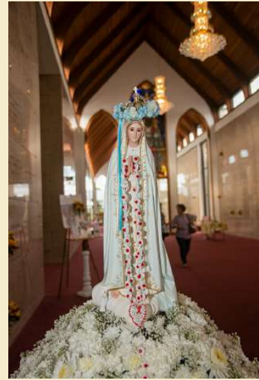
Processing with Our Holy Mother, Mary!