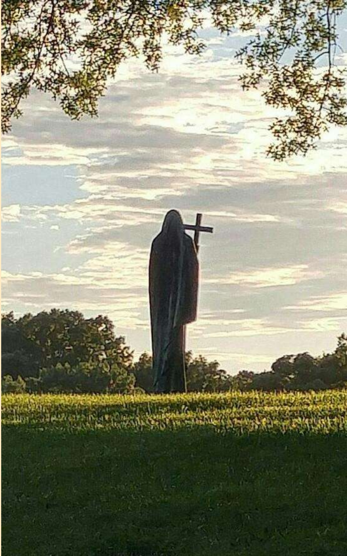
Picture above taken during the Rosary Walk at All Saints Cemetery in North Haven