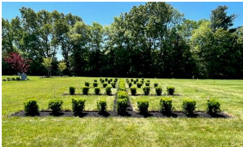
Holy Cross Cemetery-Glastonbury (pictured above)