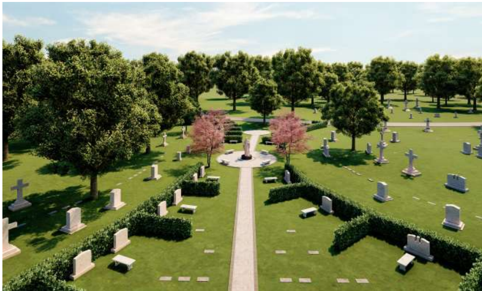
Mt. St. Benedict-Bloomfield (pictured above)

The better educated you are the better choices you can make!