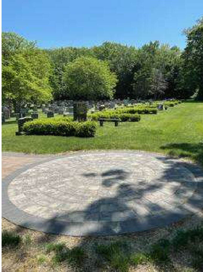
Calvary Cemetery-Waterbury (pictured above)