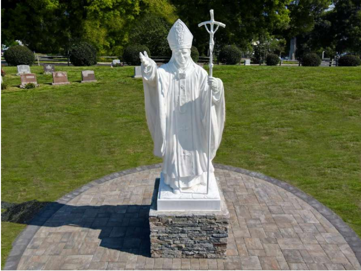
St. Pope John Paul Statue (above) at St. Mary's Cemetery