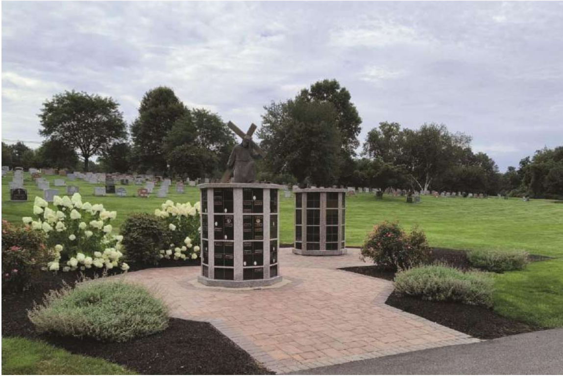
A New Columbarium (above) at St. John's Cemetery