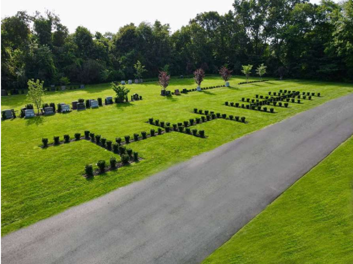
Semi-Private Estates (above) at Holy Cross Cemetery