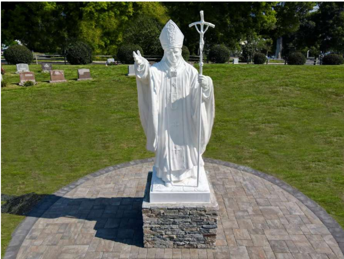
St. Pope John Paul Statue (above) at