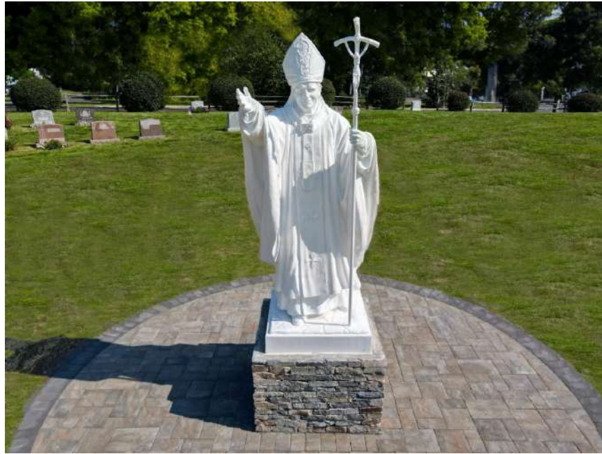
St. Pope John Paul Statue (above) at St. Mary's Cemetery