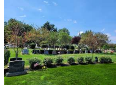
Monument sections are still available at Calvary Cemetery