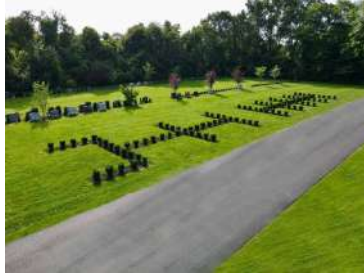
Semi-Private Estates at Holy Cross