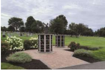
St. John's Cemetery