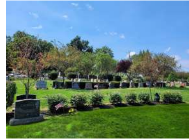
New Monument sections are available at Calvary Cemetery

Visit West Haven and Waterbury to see our NEW Columbaria