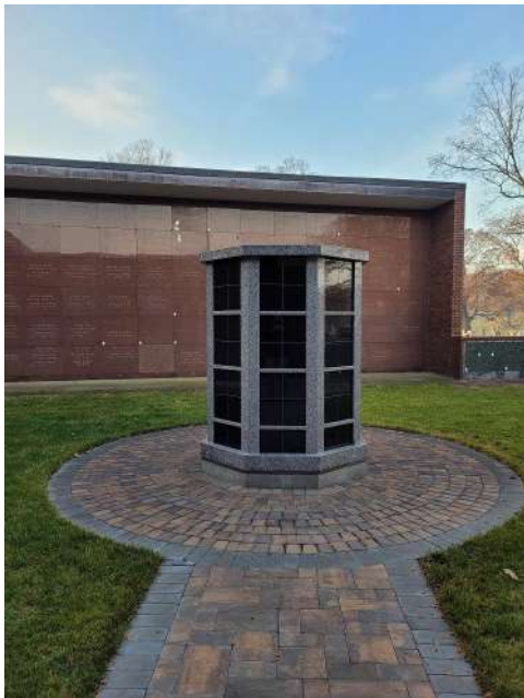
St. Lawrence Cemetery

Visit West Haven and Waterbury to see our NEW Columbaria