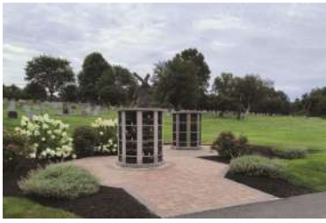
St. John's Cemetery