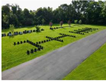
Semi-Private Estates at Holy Cross