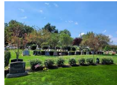
New Monument sections are available at Calvary Cemetery

Visit West Haven and Waterbury to see our NEW Columbaria