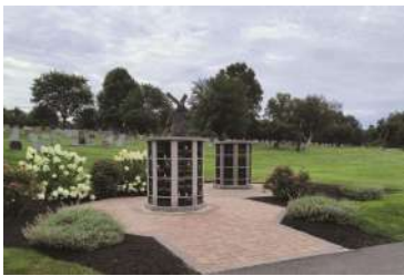
St. John's Cemetery