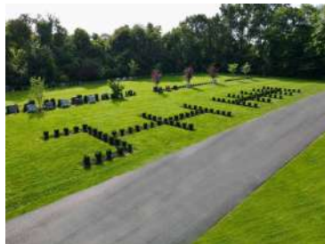
Semi-Private Estates at Holy Cross